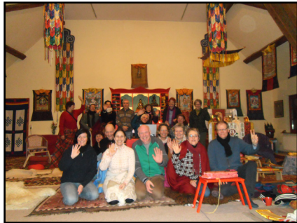
A group of students gathered at Kagyu Benchen Ling in Germany to watch