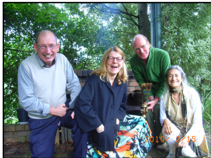
Students in Australia tuned in to watch

Dear Marpa House, I would like to express my heartfelt gratitude to all those involved in organising the live streaming of the anniversary ceremony - and also, of course, great gratitude to the Lama himself for his presence there. It was absolutely thrilling to be able to be part of it - to be, more-or-less, in the Shrine room with you all - from so far away. It brought tears to my eyes. I miss you all - and it was exciting and fun to try and figure out who was there .... mostly from the backs as people walked up for a blessing!! A wonderful experience to be there with you all and feel part of the celebration.